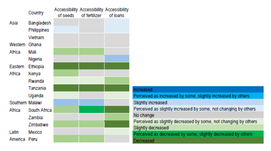
Figure 2. Early effects of COVID-19 on farming inputs

In Southern Africa, the agricultural season is ending with mixed results with a bumper maize harvest expected in South Africa and poor production in Zimbabwe and parts of Mozambique. According again to the WUR 2020 study and other sources, agricultural staples production is generally not a major issue, but the impact of COVID-19 containment measures on the economy and in particular on the informal sectors is significant and urban poor population are vulnerable to declining availability of fresh food.